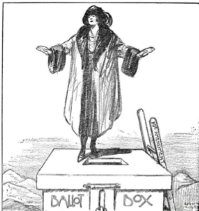
THE END OF THE CLIMB

Use the cartoon below to answer questions 17-19